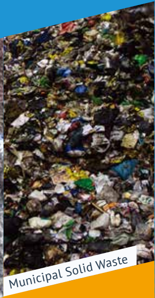
Municipal Solid Waste