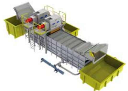
ADOS Mill + SEDImentation Tank

The slurry is passed to the sedimentation tank, where it is homogenized and separated into three layers - heavy sediment on the bottom, floating particles on the top, and putrescible material in the middle. The top and bottom layers are removed; and in addition, cooking oil can be removed from the floating layer as required. The putrescible material is pumped to a buffer tank.