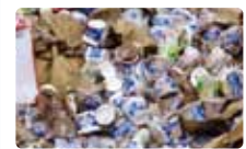
Food Processing Industry

ADOS plants are highly scalable and are suitable for many contexts and applications – from small towns to large cities. The most cost-effective plant size starts from 60-70 tons per day (tpd). Colocation or downstream location from MSW collection and treatment plants can further improve efficiencies.