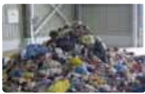
Mechanically Separated MSW (OFMSW)

DP's ADOS system ( A naerobic D igestion of O rganic S lurry) is an end-to-end integrated system for use in Anaerobic Digestion plants. It was developed by IUT GmbH based on decades of research, plant operation experience and process refinement. It uses a "semi-dry" process which has the benefits of both the typical "dry" and "wet" AD processes. From pre-treatment to post-treatment, the ADOS system efficiently converts organic waste from many sources to high quality biogas and digestate.