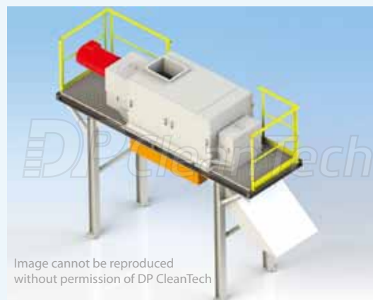
ADOS Mill with support structure