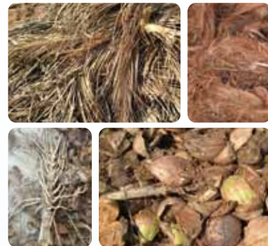
Variety of coconut wastes