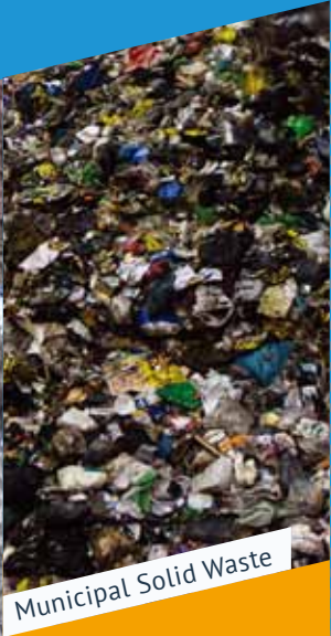
Municipal Solid Waste