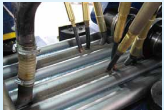
Membrane Wall Machine (SAW)

particularly suitable for bending of spiral walls. DP's specialty is connecting flanges, spiral walls and funnels.