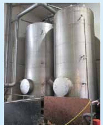
Commercial waste hygienisation vessel