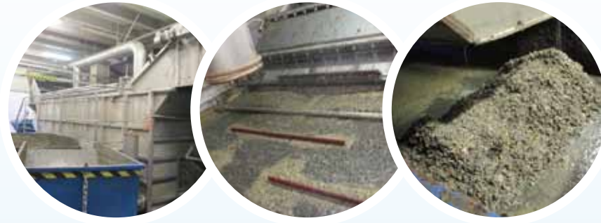
Sedimentation tank Floating particle separation Heavy particle collection

Once shredded, the slurry is pumped to a Sedimentation tank (SEDI tank) where yet more inorganics are removed. Lighter particles float on the surface and are collected at one side of the separator; heavier particles will sink to the bottom, where they are collected at the other side of the separator. The liquid slurry is extracted from the middle and pumped to the digester